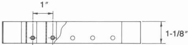
BLADES INDIVIDUALLY ADJUSTABLE

THE AIR-TRAC ® MODEL EGR IS DESIGNED FOR EVEN FLOW OF AIR FROM ROUND DUCT TO THE MAIN SUPPLY RUN. BLADES SET AT 90°, AIR WILL FLOW EVENLY THROUGH TAKE-OFF.